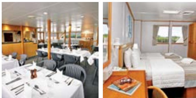
Recently refurbished dining room (left) and Stateroom, on board Coral Princess